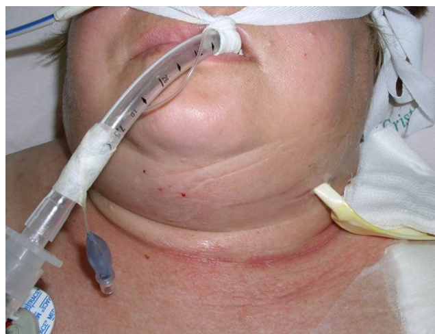
Fig. 2. Extraoral drainage of submandibular abscess and placement of a Penrose drain.