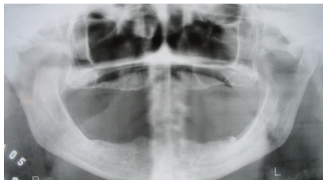
Fig. 1. Panoramic radiograph showing root canal debris at the region of tooth no. 37 (potential cause of submandibular abscess).

Antibiotic therapy was changed to intravenous vancomycin 1 g every 12 hours due to the presence of hospital-acquired pneumonia, plus intravenous imipenem 500 mg every 6 hours. Dressings were changed daily, and the amount of secretion collected was observed.