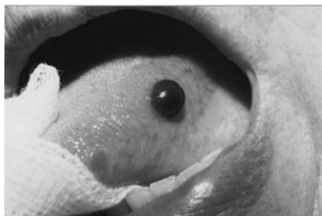
Figure 5 - (Case 5): Clinical aspect of angina bullosa hemorrhagica on side of tongue.

of an asymptomatic blood blister on the side of her tongue (Figure 5).