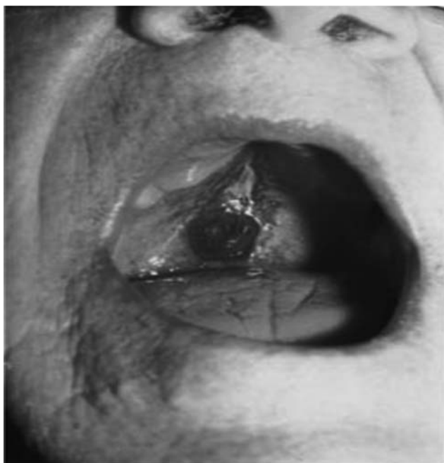
Figure 3 - (Case 3): Clinical aspect of angina bullosa hemorrhagica on soft palate after spontaneous rupture of lesion.